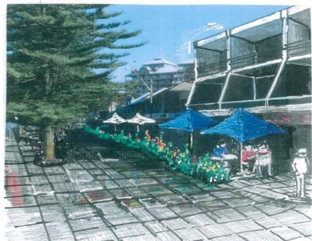
Artists Impression of Terrigal Esplanade