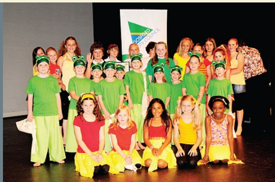
Gosford Public School, winners of the Mayoral Award for Performing Arts.

KINCUMBER PUBLIC SCHOOL PRETTY BEACH PUBLIC SCHOOL SOMERSBY PUBLIC SCHOOL